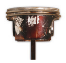
The piston can become dirty on the edge and rings.

* e.g. with a conventional two-stroke engine oil of performance class API-TC