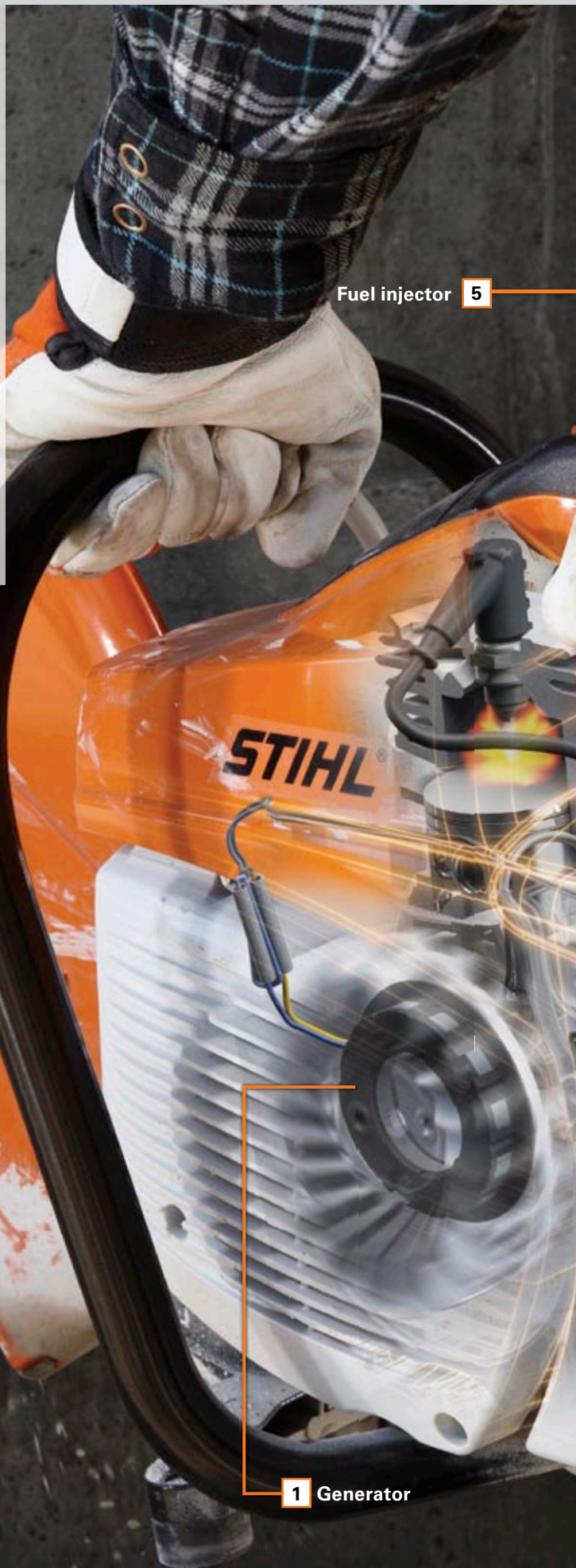
Fuel injector 5

Discover a whole new kind of cutting, with STIHL Injection. At the heart of this revolutionary technology is the electronic engine management system. For the first time ever, the saw's ignition timing is defined not only by the engine speed – but also the load. The ideal settings for ignition and fuel injection are calculated constantly while the tool is in use, so you can rely on an optimal performance at all times. And thanks to this new technology, you won't have to compromise when it comes to the engine settings: it makes the carburetor and all manual settings redundant. The fully automatic engine settings guarantee optimized performance and fuel consumption and first-class power delivery for any kind of cutting job.